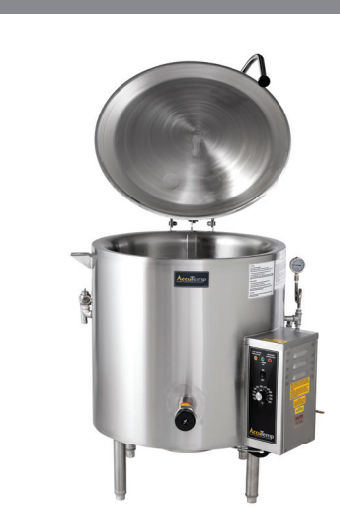
Model ALLGB-40 shown with included tangent draw off valve and lid

AccuTemp product may be covered by one or more US Patents. See www.accutempip.net MM6262-2503