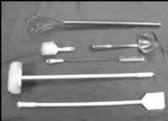
kettle brush cleaning kit

Customize the Edge™ Series Kettle to make cooking (and cleaning) easier. AccuTemp offers single and double pantry faucets, a kettle brush cleaning kit, and triple perforated SS baskets.