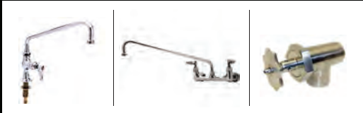
single pantry faucet