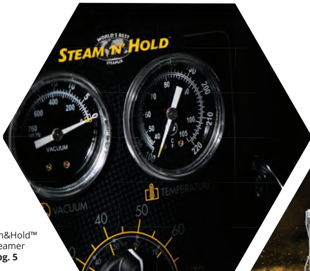
Steam&Hold™ Steamer pg. 5