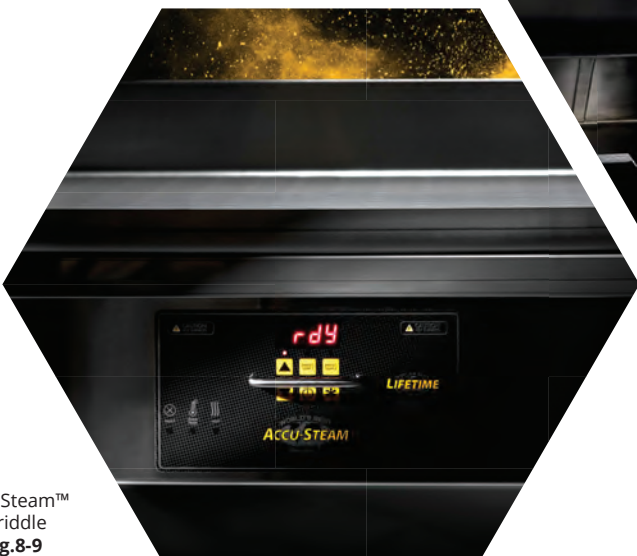
AccuSteam™ Griddle pg. 8-9