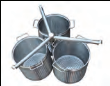
triple perforated SS baskets