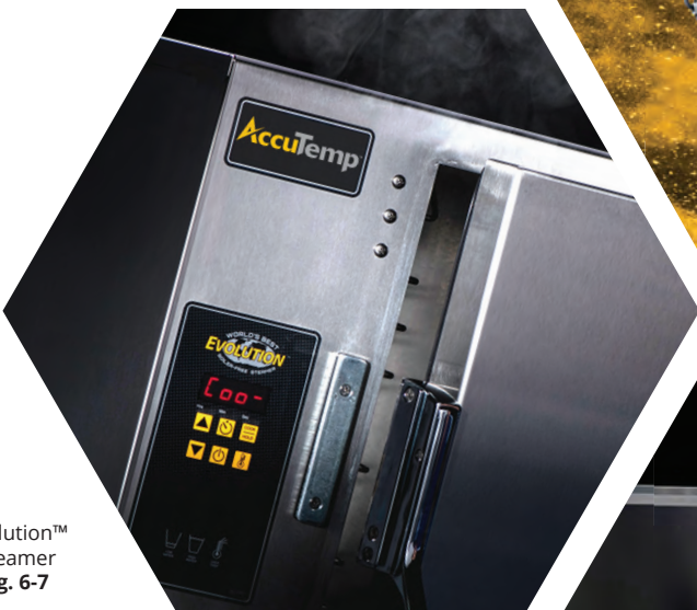
Evolution™ Steamer pg. 6-7