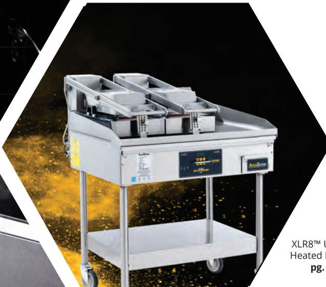
XLR8™ Upper Heated Platen pg. 9