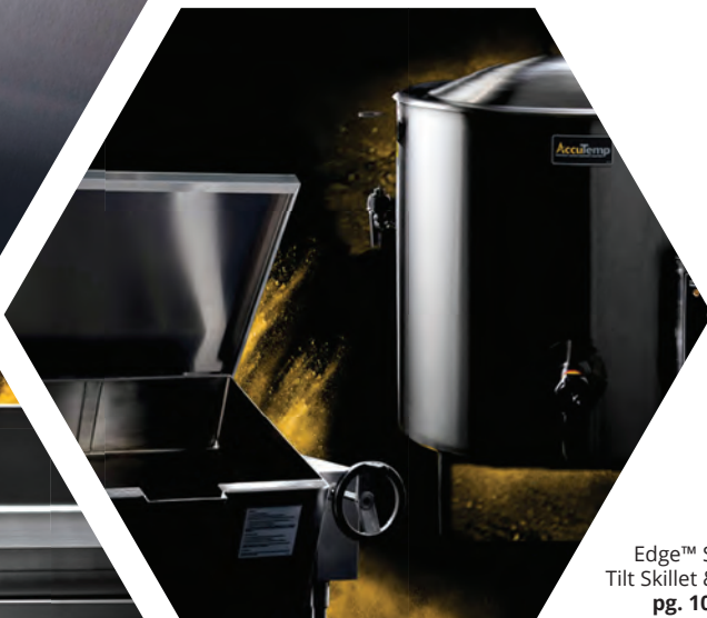
Edge™ Series Tilt Skillet & Kettles pg. 10-11